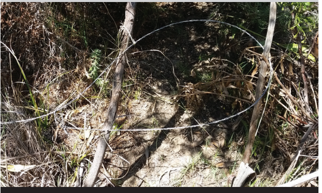
Snare with guide sticks

A snare trap is a simple piece of wire, cable, twine or nylon fashioned into a noose. The noose is then anchored to trees, fence posts and other vegetation, and positioned in such a way to capture animals either by the foot (placed parallel with the surface) or by the head or body (suspended vertically).